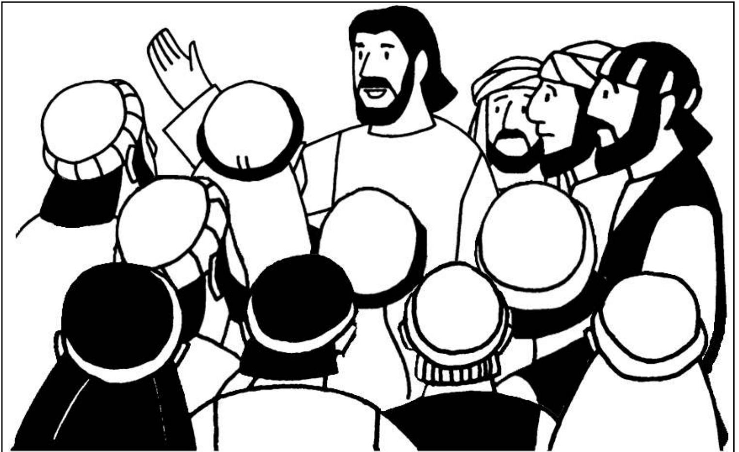
Jesus teaching to his disciples