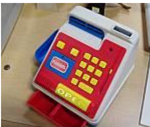
10) Toy Cash Register