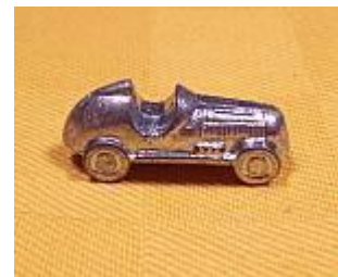
9) Monopoly Playing Piece