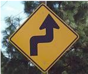
7) Sharp Curves Ahead