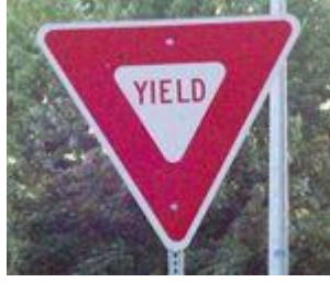
2) A Yield Sign