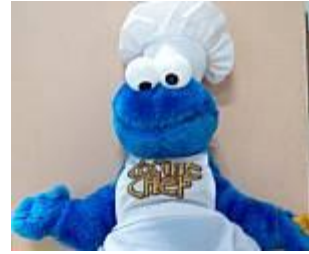
3) Cookie Monster