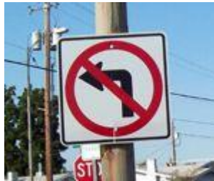
8) No Left Turn