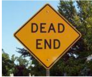
5) A Dead End