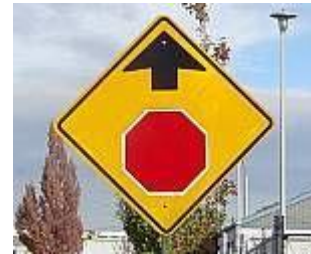
9) Stop Ahead