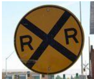
11) Railroad Track Crossing