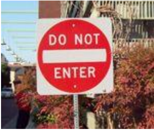
4) Do Not Enter