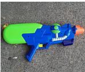
7) Squirt gun