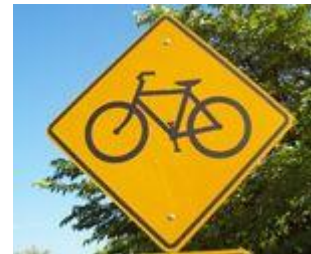
12) Bikes On Roadway