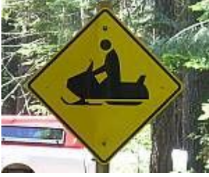
1) Snowmobile Crossing