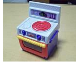
6) Toy Stove