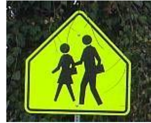
6) School Crossing