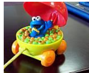
12) A Child's Pull Toy