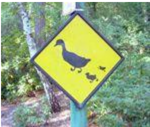
10) Duck Crossing