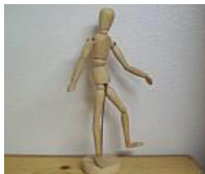
11) A Poseable Human Figure