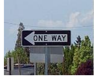
3) One Way Street