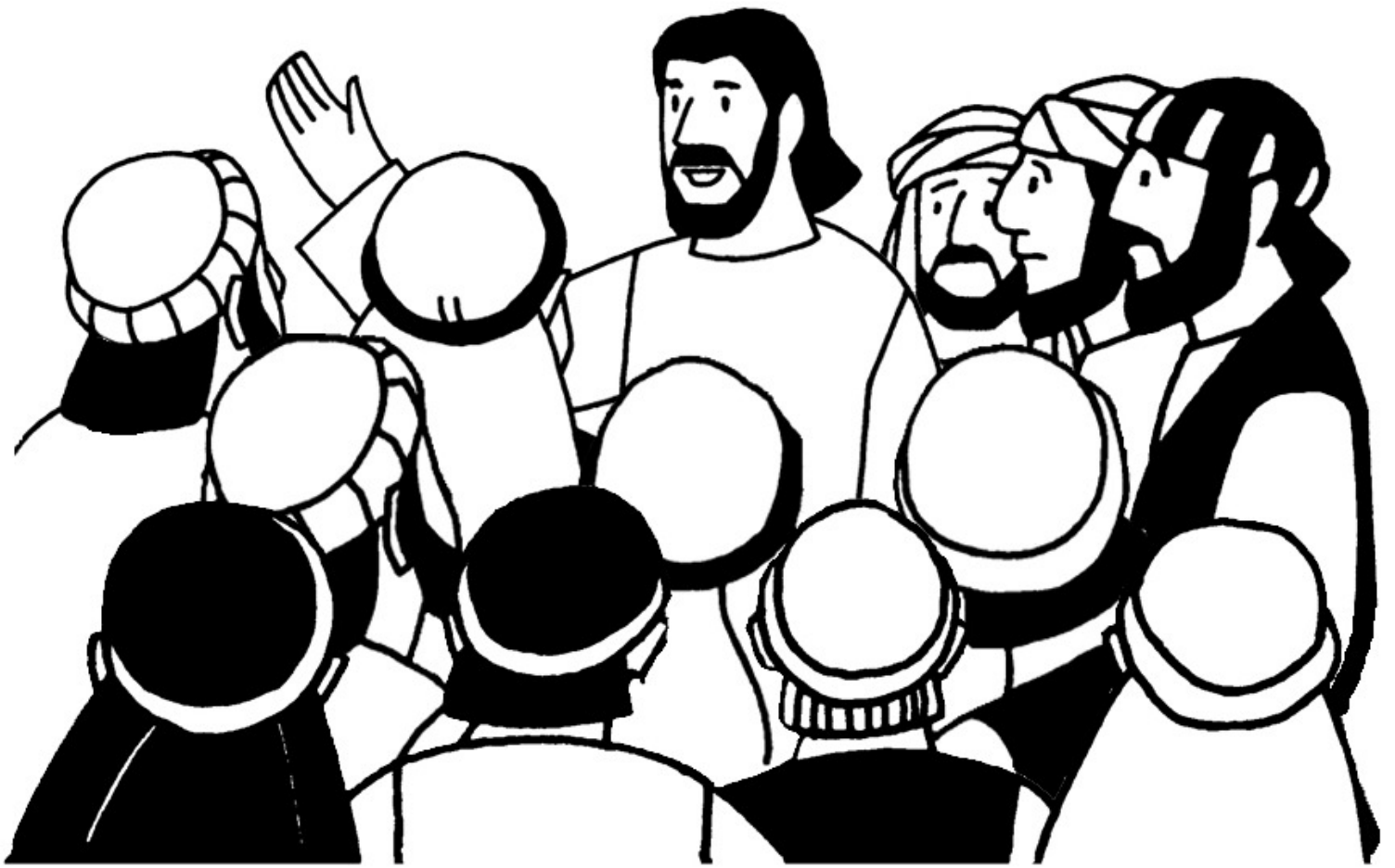
Jesus teaching to his disciples