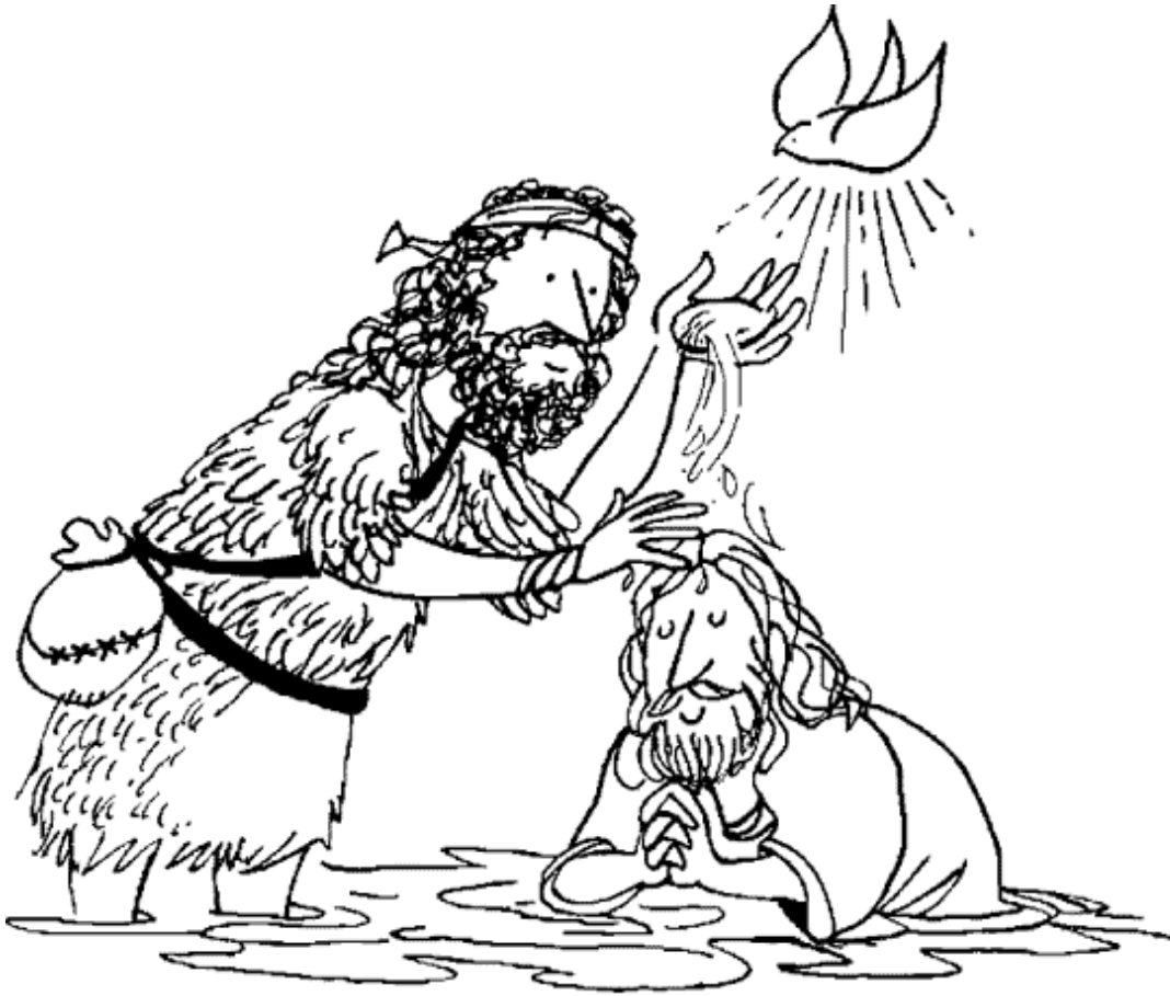
Jesus is baptized