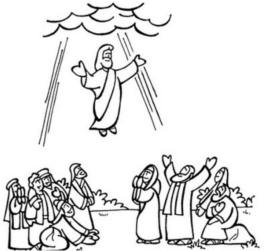
Ascension of Jesus