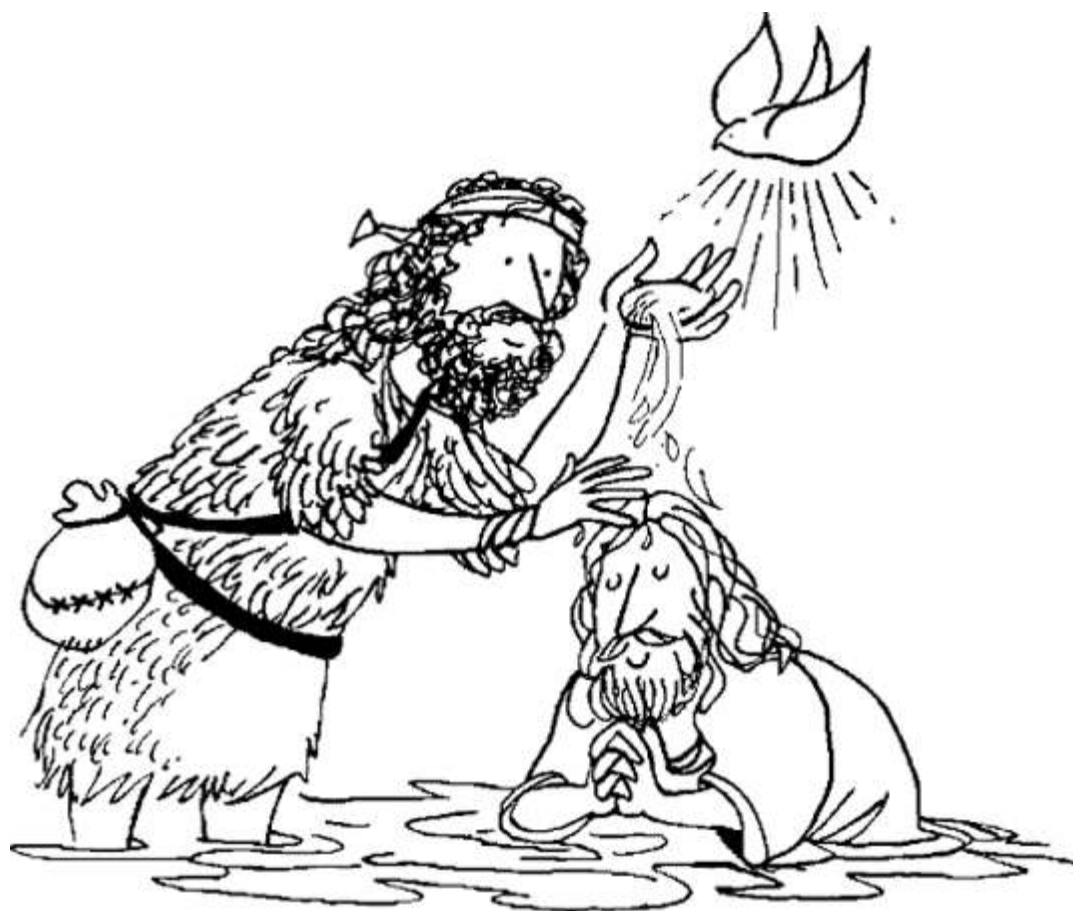
Jesus is baptized