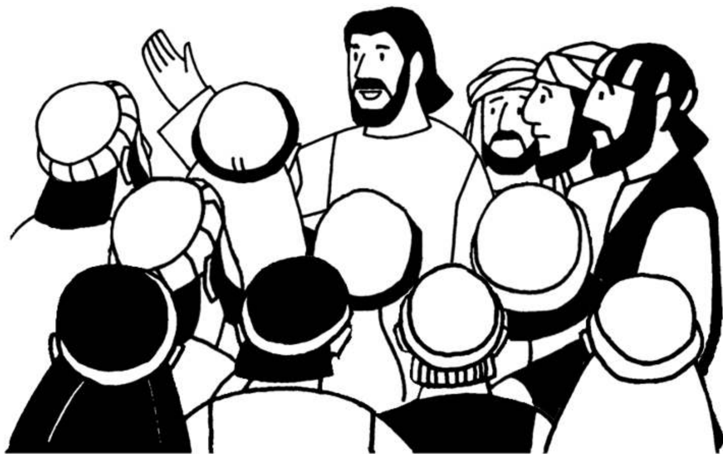
Jesus teaching to his disciples